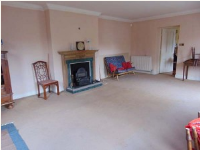
Family Room/Sitting Room (West facing)