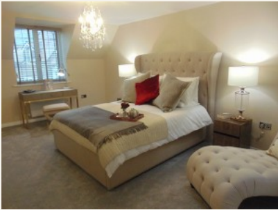
Bedroom No. 2