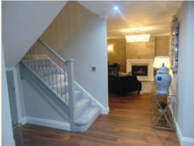
Open Plan Hall