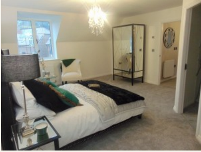
Bedroom No. 1