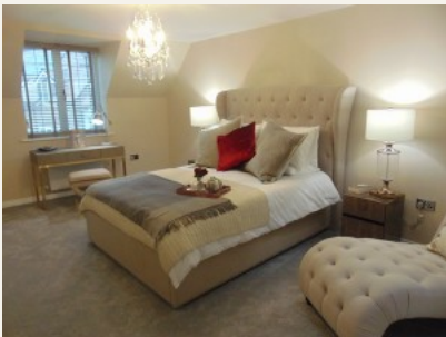
Bedroom No. 2