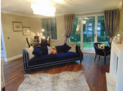
Delightful Spacious Lounge