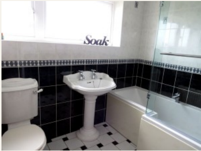
Fully Tiled Bathroom

with window to side, coved ceiling and access hatch to roof space