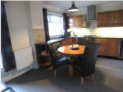
Open Plan Family Room/Dining Kitchen

Measurements: 15'8" x 13'5" narrowing to 9'2"